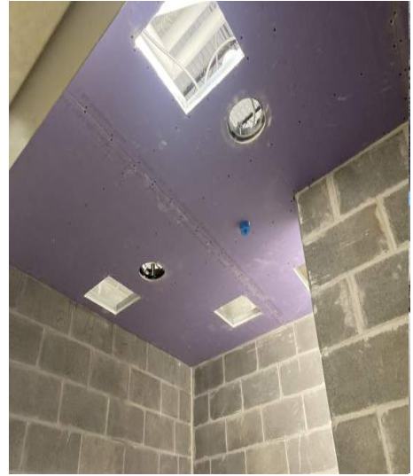
Ceiling drywall installation