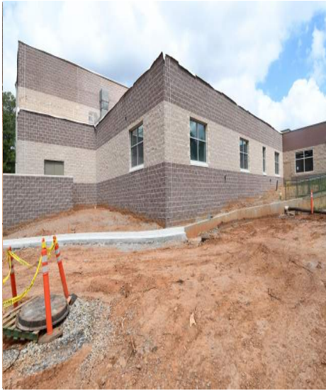
Rear exterior view of building