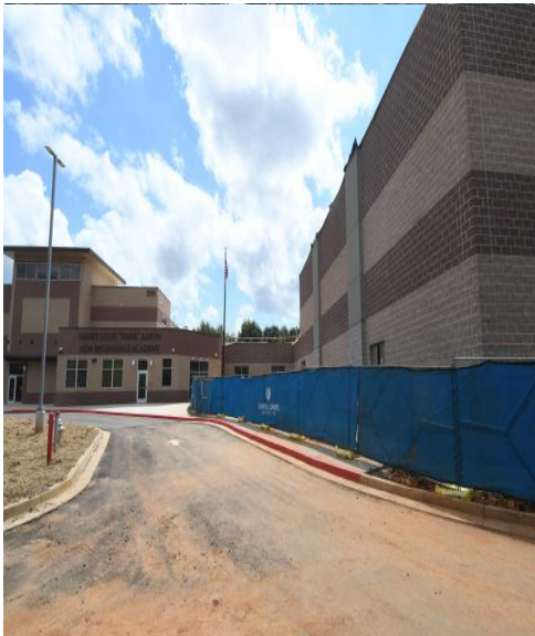
Exterior view of bus loop entrance.