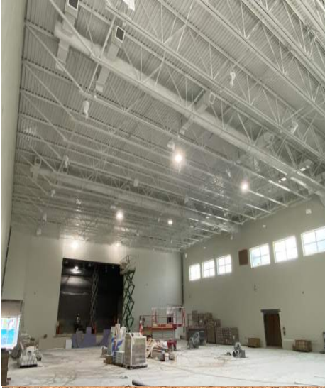
Gym ceiling dryfall finished