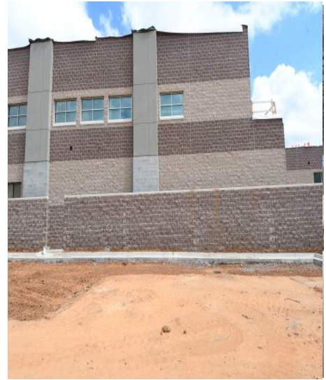
East side exterior view