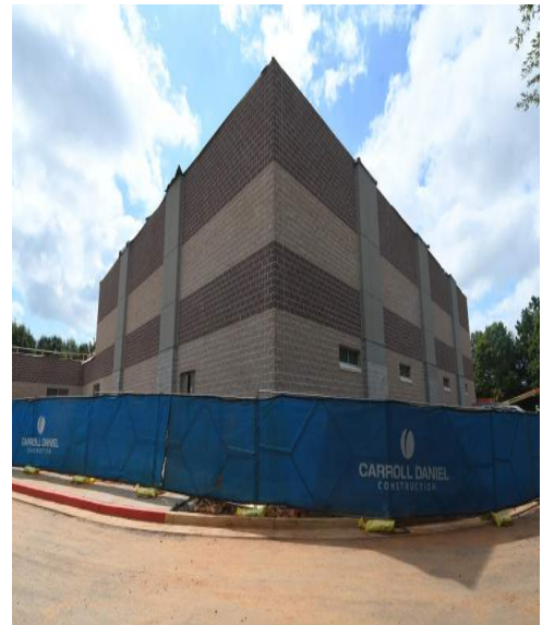
Building exterior – front-facing view