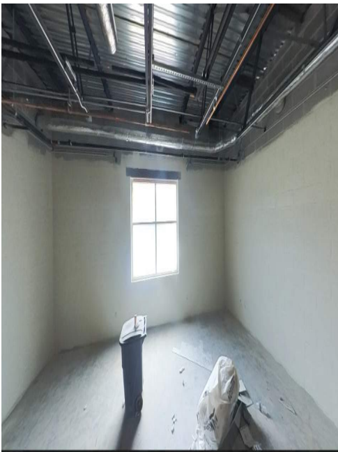
Blockfill completed in classroom